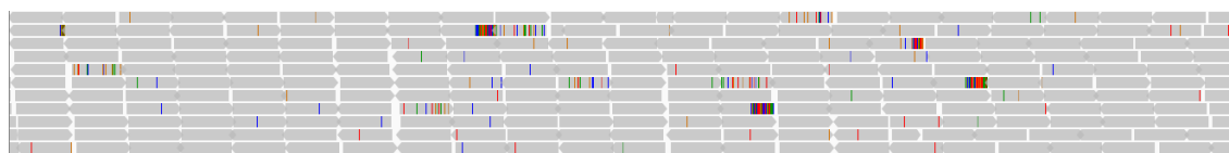
Figure 3: Simulated reads mapped in proper pair. Mismatches and soft-clips are shown as colored vertical lines in reads.